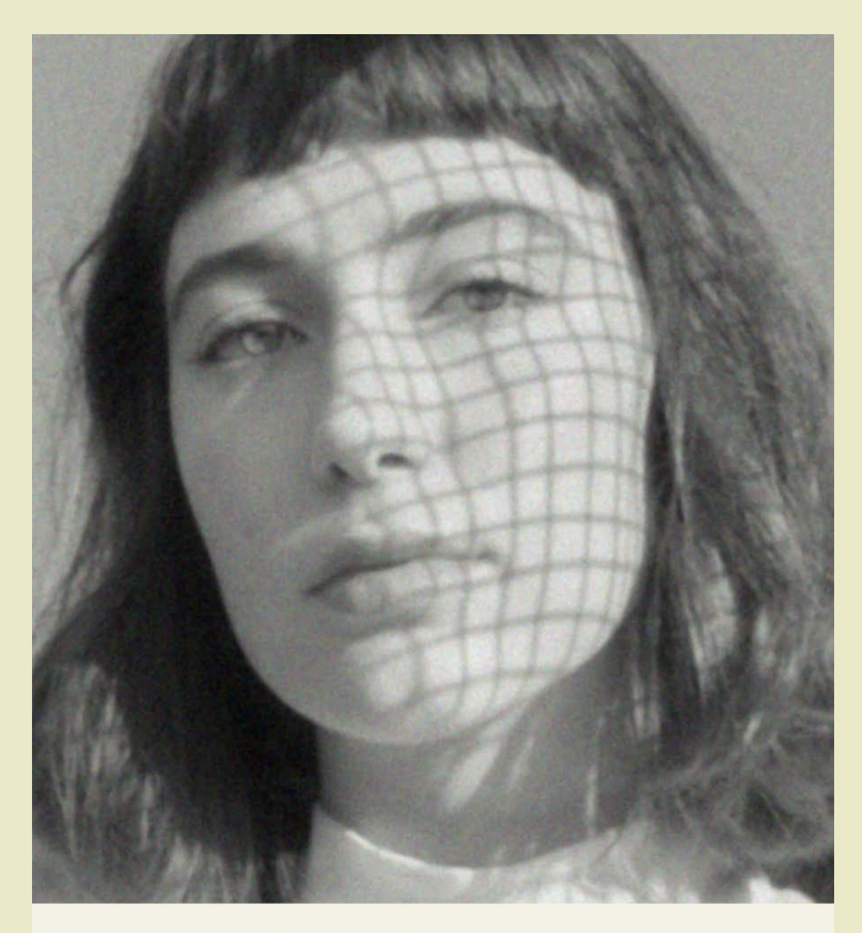
W. District — Environmental Design — Fall 2018